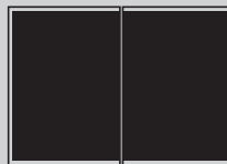
a) DPS 255 x 390mm

The Show Issue is American A4 – 205mm (width) x 275mm (height)