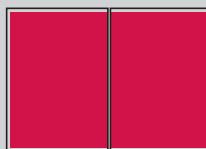
a) DPS 255 x 390mm

The Show Review is American A4 – 205mm (width) x 275mm (height)