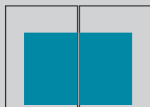
c) A4 DPS 410 x 275mm