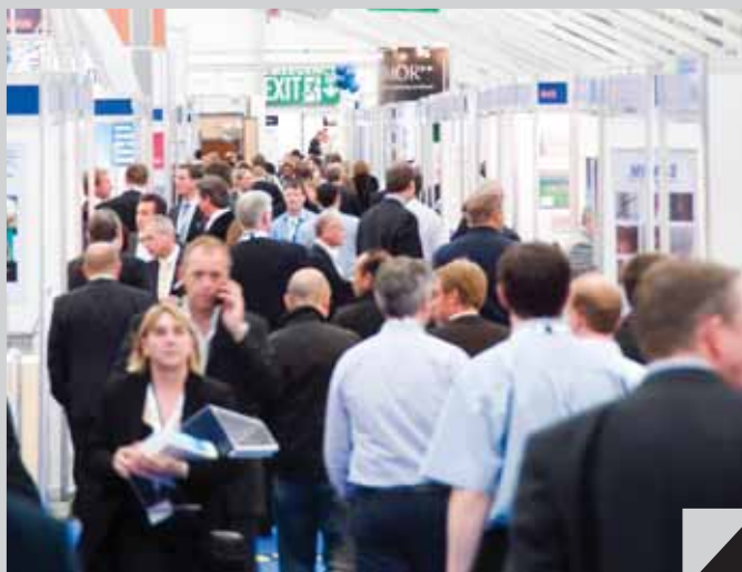
Ad Booking Deadline: 17th August 2009 Ad Copy Deadline: 24th August 2009